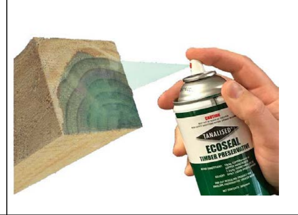
Approved sealants for LOSP treated pine.

If I had to hazard a guess as to what happened in the handrail in the opening images I would say that the ends weren't sealed with a preservative rather simply just cut to length, Alternatively, the ends may have been painted which you can do with hardwood, but with pine, the moisture that is trapped inside almost guarantees decay. My preference between the two sealants from Arch Wood Protection above is Ecoseal as, with its green colour, you can inspect and confirm that the end has been sealed. So, when specifying pine, handrail ensure you have a note about sealing the end of the handrail and note the required sealant otherwise it will be ignored or simply get painted.