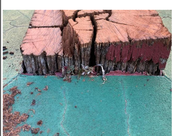
The Cross donated by our family in 1967 to St Albans Church, Gatton

View of the cross section 100 above groundline after removing for safety