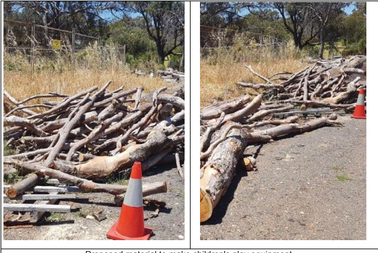
Proposed material to make children's play equipment