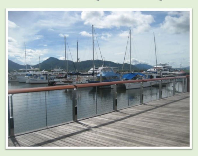
A very well designed handrail

I have now completed my coastal deck course. The main part of the seminar takes you through the design checklist in my Deck and Boardwalk Design Essentials, line by line and explains and illustrates why that line is there and why that aspect of the design must be attended to. There are three supplementary sections: