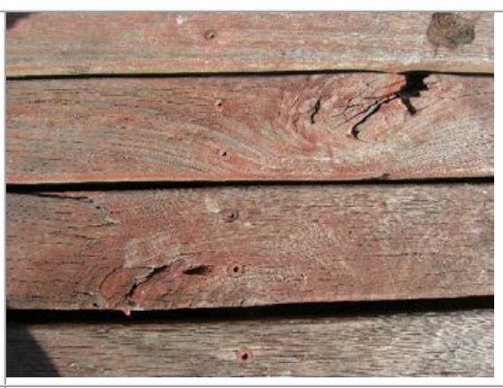
When you stagger and predrill the joist does not The poor quality of decking you may receive if split