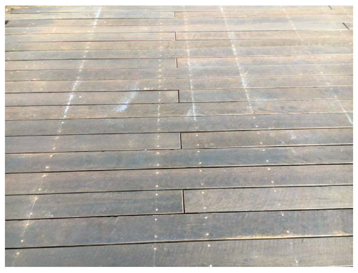
Newly Laid High Quality Decking

Predrilling Joists for Screws is Critical