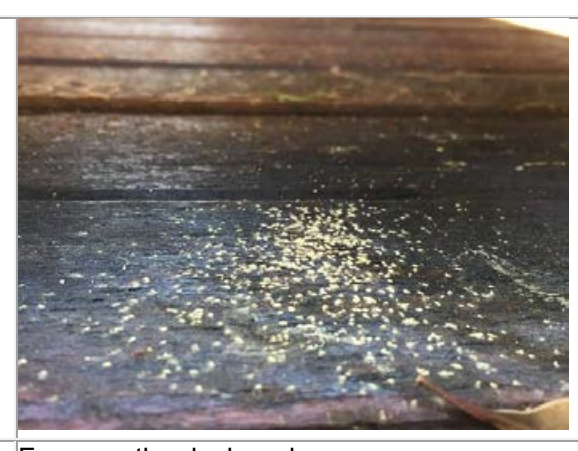
Frass on the deck under