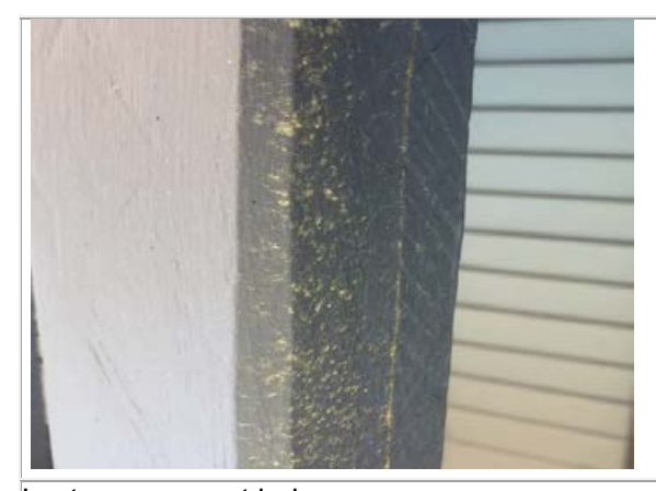
Lyctus emergent holes

not to their liking and leave. The attack ends when the timber is dry. The client whose timber post is illustrated asked, "Why did they attack if the timber is treated?" But treatment is not a repellent and if the insect does not actually eat the timber it will not be poisoned. But don't worry, they do minimal damage as the image shows.