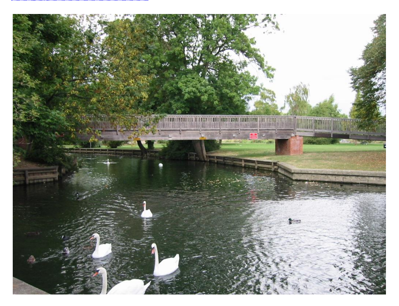
Timber Footbridge at Windsor UK

I am well under way on my sixteenth book since semi retiring (not all are on timber). That doesn't count the eight guides written previously. This latest guide deals with footbridges. Now, I already have a guide on footbridges and it tells you what to build. This new book primarily deals with How. I have about 50 pages put together including 20 on handrail. I am looking for images and hope my readers can help me. What I am particularly looking for are